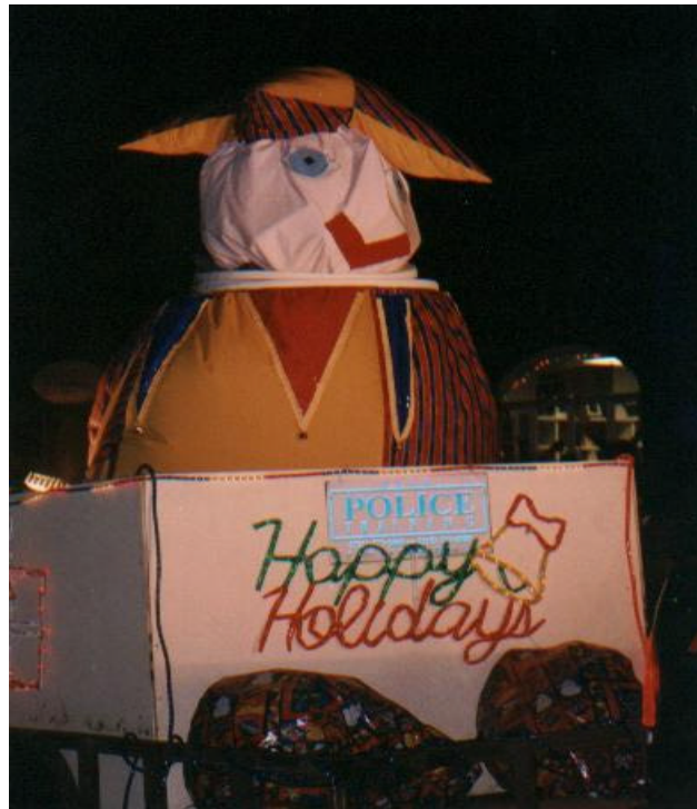
"Jack In The Box" Parade Float

Our parade float debuted at the Yardley Annual Olde Fashioned Christmas Parade - although it was close! The week before, we received more snow in one day (just over 8") than we did for all of last year ! After the storm, we tried to do our initial assembly, which included putting the "Main beam" and generator on top of the trailer and then backing it under our temporary car canopy. That was when we (quickly) learned that the canopy was about 2' too low for the trailer assembly to fit! After some innovations & adjustments, we were able to get everything to work and have Jack's +40" head raise over 4' out of his 6'w x 8'l x 4'h Box, despite the average 20-degree (F) temperatures! His color photo even ended up on the front page of the Yardley News, right below Santa Claus!